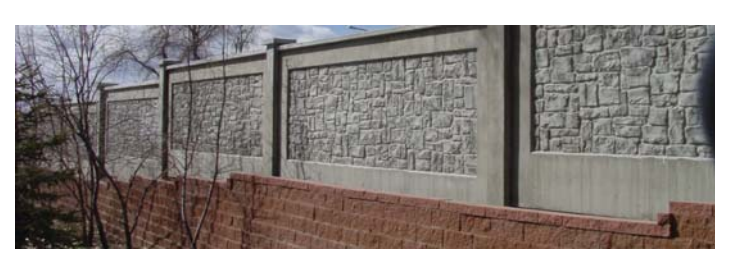
Option 2 Framed Tumbled Stone