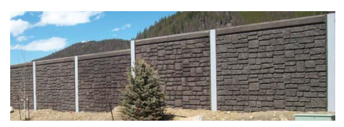
Option 1 Current Swan Mountain Sound Wall